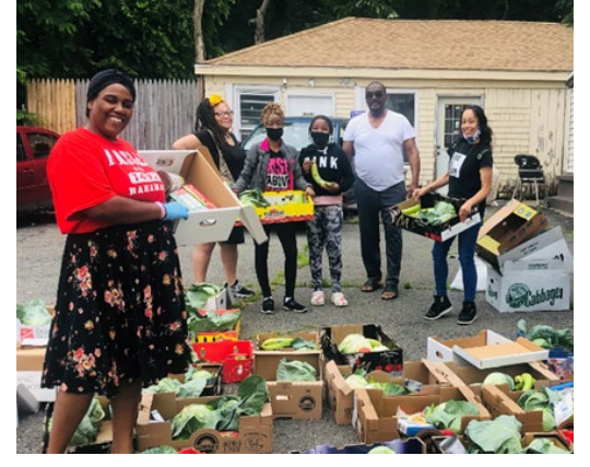
Volunteers at the Hyde Park community food hub, one of several sites where we're partnering with residents to distribute food directly to their neighbors.

Health Leads is partnering directly with community members in Boston's Hyde Park, Dorchester, Mattapan, Roxbury, and Roslindale neighborhoods to pilot the Neighborhood Food Action Collaborative (NFAC), a unique, hyper-local model of food distribution. NFAC's food distribution hubs enable local residents to be at the center of decision-making processes, increase the amount of food available in their neighborhoods, set new standards for success, and offer individualized food resource navigation assistance, including SNAP enrollment.